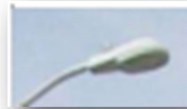
L38, L39, L40, L41

OFFICIAL rates can be found in the City of Gainesville-Code of Ordinances-Appendix A, which supersedes this and any other publications.