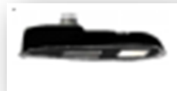
L42, L43, L44, L45, L46