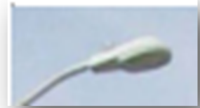
L38, L39, L40, L41