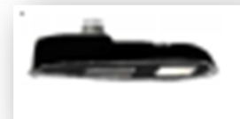
L42, L43, L44, L45, L46