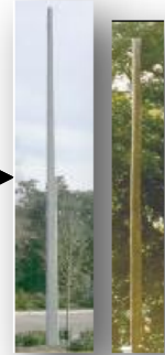
P8, P9, P12, P13, P15, P16, P18, P19